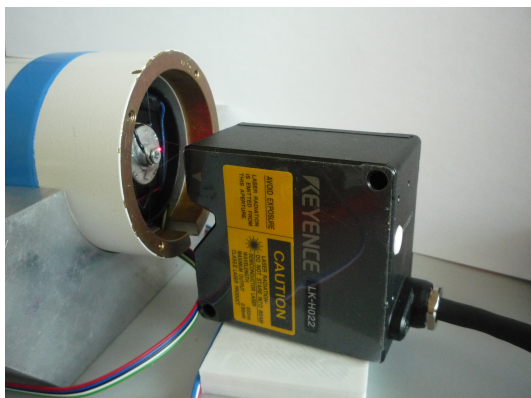
Figure 1: Laser vibrometer utilization in the velocity scale linearity evaluation process.

A linearity of the Mössbauer spectrometer velocity scale is evaluated. Non-contact method for measurement the mechanical displacement of the moving part in the double-loudspeaker type velocity transducer is presented. For this purposes the laser vibrometer based on Keyence LK-G5000 system has been utilized (Figure 1). Real displacement ( \mu\text{m} ), velocity ( \text{mm/s} ) and acceleration ( \text{mm/s}^2 ) of Mössbauer source were recorded for the analysis (Figure 2). Velocity driving system of the spectrometer is based on digital PID controller concept [1,2] deployed in FPGA chip on sbRIO real-time hardware device (National Instruments). Moreover, the vibrometer output signals are connected to the controller and evaluated there. The reference distance and displacement measurement range is 20 \pm 3 mm with the repeatability of 0.02 \mu\text{m} . The results show the possibility to use the proposed system for velocity scale linearity evaluation. This feature has a big importance when measurements in external magnetic field are performed and real velocity can be distorted comparing to the expected shape. This will be pointed out in discussion.