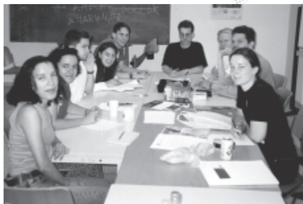
The ICPS Organisers' meeting

The General Meeting was as usual a very long event and for some people very tedious event, but it's part of the game. IAPS has to be run somehow and this is the only occasion to get some things sorted out, like the elec-