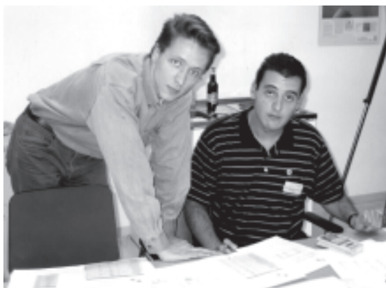
It is difficult, isn't it?