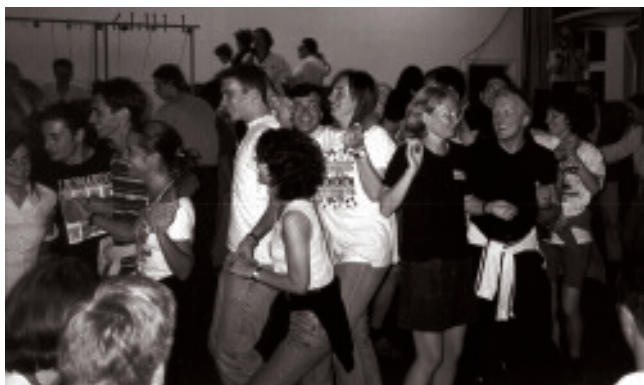
A moment of the National Party

As we drove into Vienna it started to rain, but this did not worry us at all. It was the same in Copenhagen and in Szeged and both weeks turned out to be successful and sunny. After some struggling with one-way streets we finally managed to locate the colourful building of the TU of Vienna, which seemed very quiet at first sight. Inside the ICPS-quarters it resembled more a hen house, with the organisers completely overworked and running